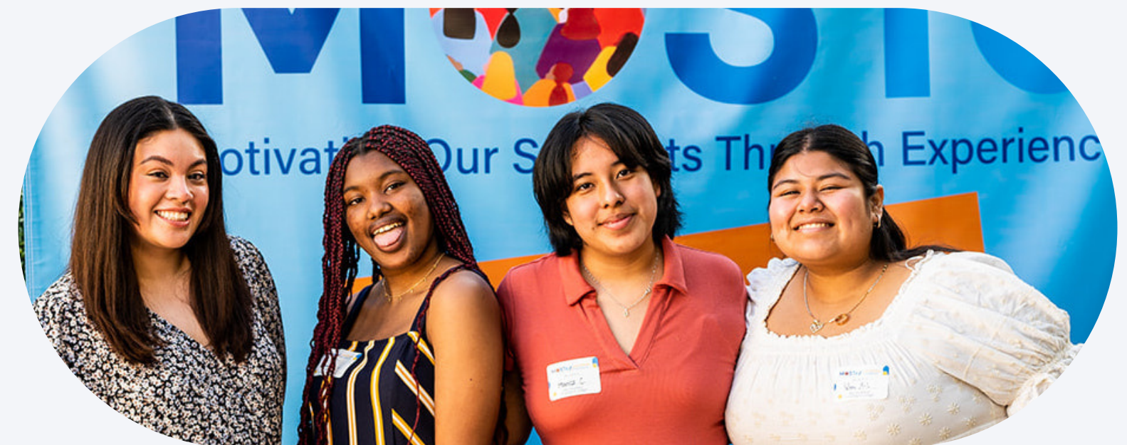
Youth Ambassadors at 2023 Lanterns Awards